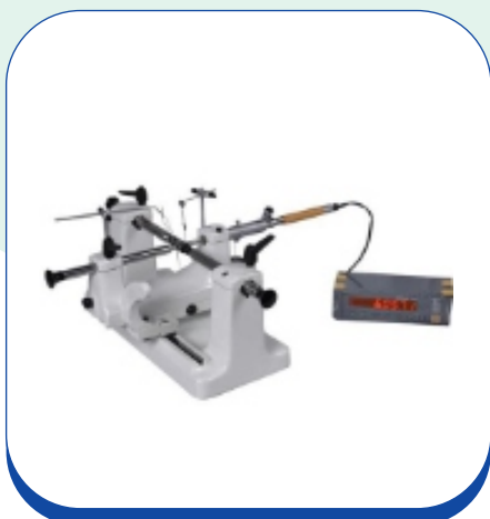
Floating Carriage Micrometer