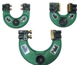
Adjustable Snap Gauge