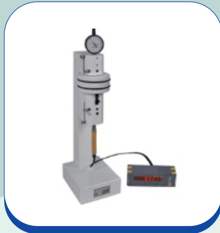
Dial Calibration Tester