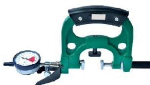
Dial Snap Gauge