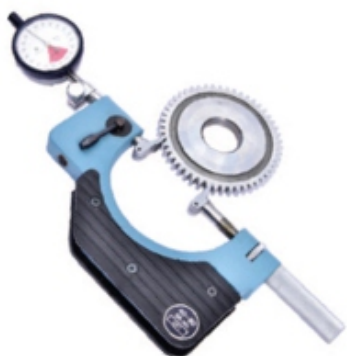
Span Snap Gauge