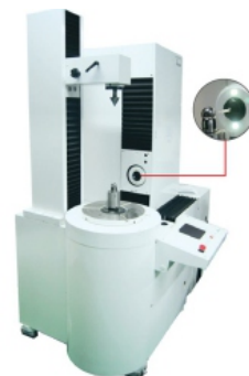
Upgradation Gear Tester