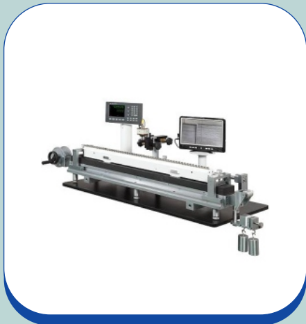
Scale And Tape Measuring Unit Line Measure 1000