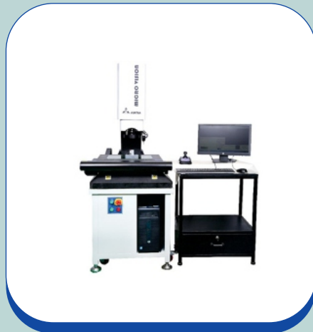
Micro Vision Measuring System