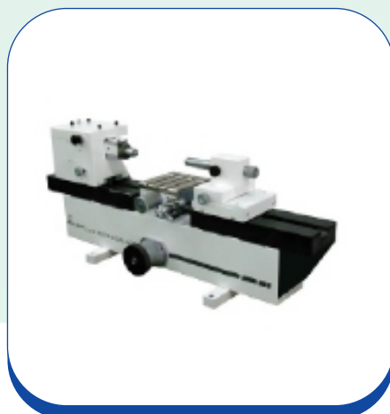
Universal Length Measuring Machine