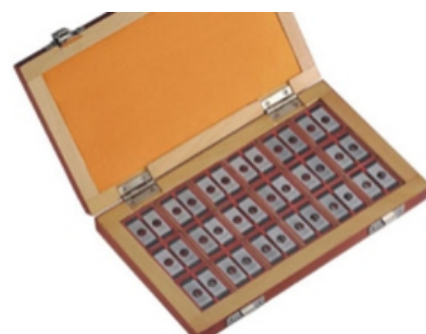
3 Wire Measuring Set