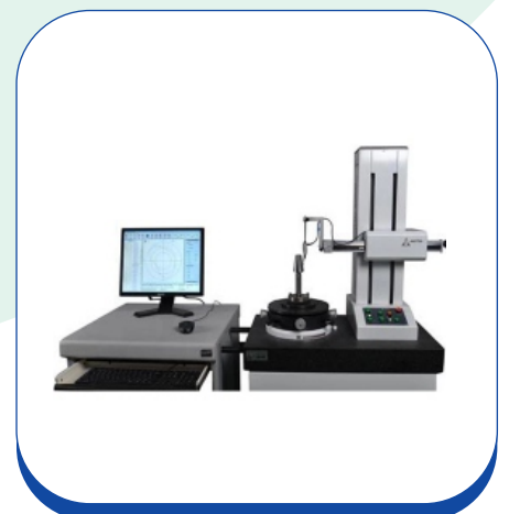
Precirond 2000 Roundness Measuring Machine