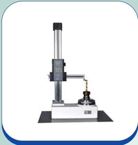
Tool Presetting Machine