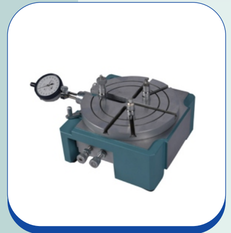
Cast Iron UD Unit