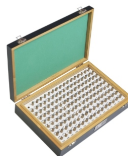
Measuring Pin Set