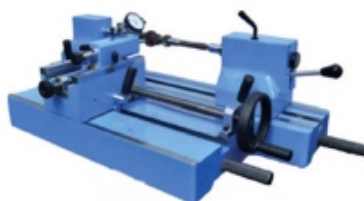
Gear Shaft Measuring Machine